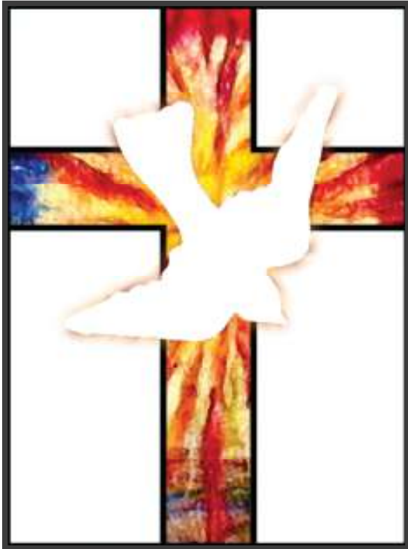
“Receive the Holy Spirit”