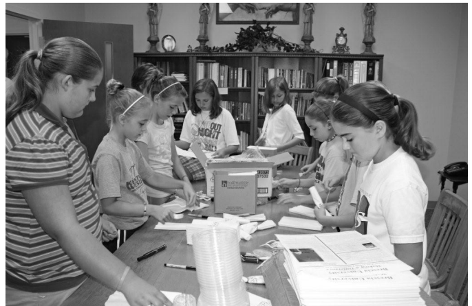
Sisters In Faith, helping with picnic preparations

Games for the Kids Outside If you want to enjoy the games bring your lawn chairs!